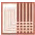
The John R. McAdams Company